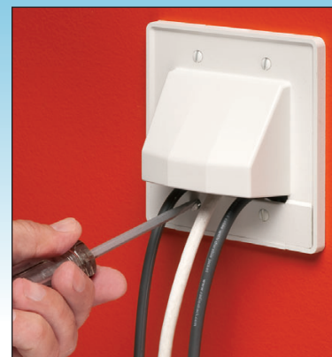
CER2 with Scoop facing OUT. Lower plate secured.