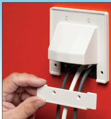
CER2 with Scoop facing OUT & lower plate removed.